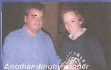
Another dinghy winner