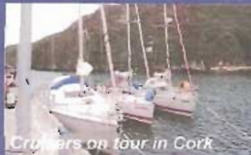
Cruisers on tour in Cork