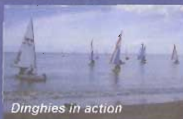
Dinghies in action