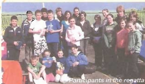
Participants in the regatta

Well we didn't get off to a great start of the season with the weather hampering the dinghy sailing during a lot of May but we did manage to host a Traveller event and coaching sessions for the Topper Class Association. Both were well attended and our Topper sailors benefitted greatly from the coaching sessions so well done to all involved. At this point I should say well done to all the Courtown sailors who travelled to the Topper Worlds in Fenit and to the fantastic results achieved. (See later)