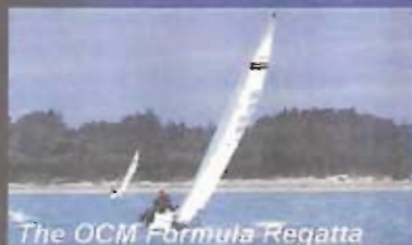
The OCM Formula Regatta