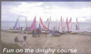
Fun on the dinghy course

Have you got any exciting CSC pics from this summer? If so please send them on to aines@indigo.ie for use on the website, future newsletters, etc.