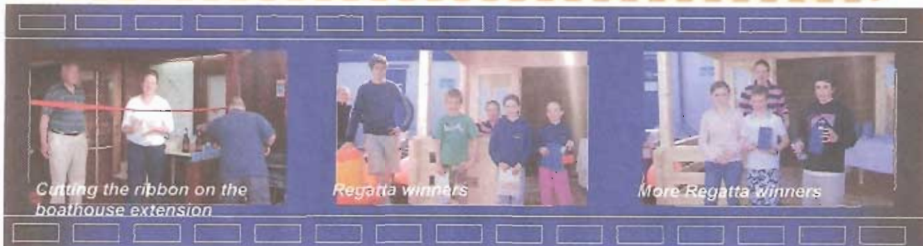
Cutting the ribbon on the boathouse extension